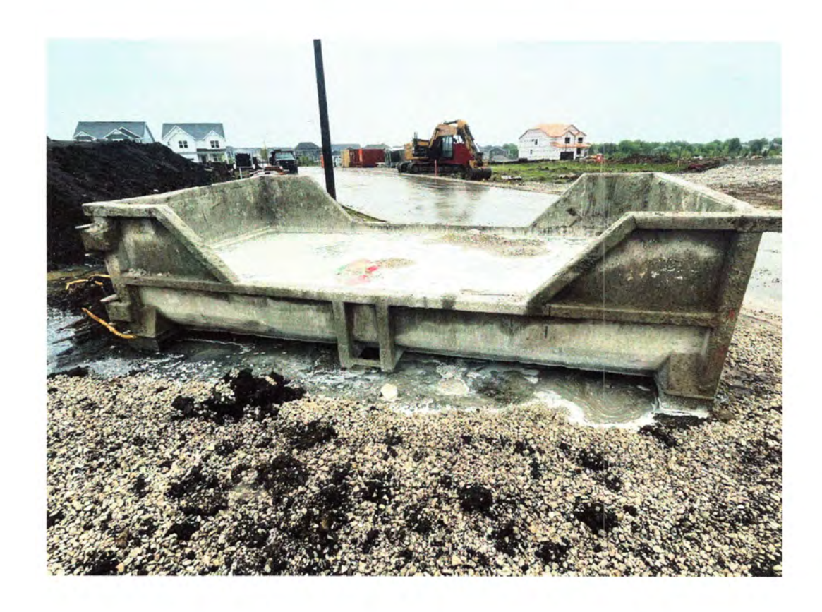
Exhibit B: Wagner Farms Site