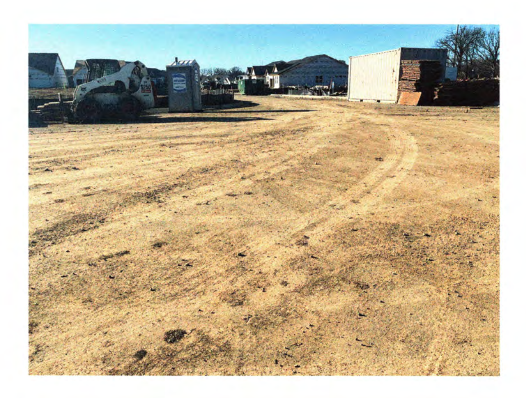
Exhibit C: Trillium Farm Site