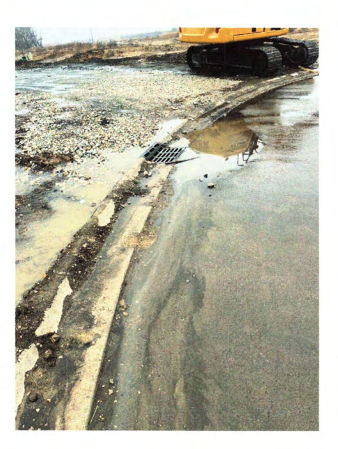
Exhibit A: Sawgrass Site